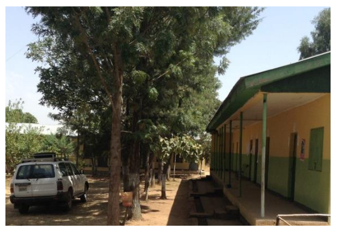
The health center - side view

Ato Gebre stated the HC makes supportive monitoring visits tothe 3 health posts every month. Also, urgent issues are addressed in between the visits. Finally, he explained that the CASH system has been under implementation since the past two years using the guideline.