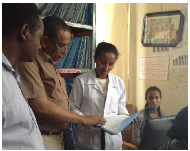
Digitizing patients' notes currently on process

The hospital received award from "Ethiopian Hospital Alliance for Quality" and received a grant amounting ETB