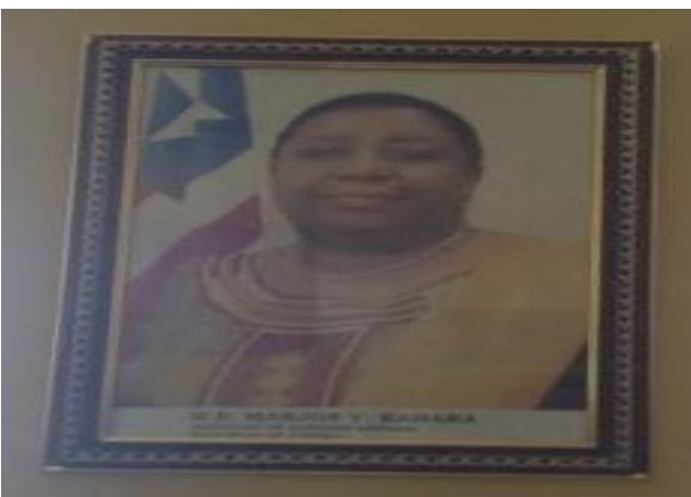
HE Marjon V Kamara, Minister of Foreign Affairs