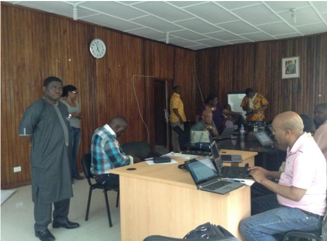
Consultative review meeting – all technical working groups