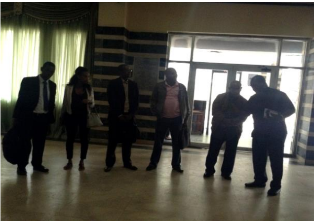
Ethiopian experts at the MoFA main entrance waiting for honorable Minsters