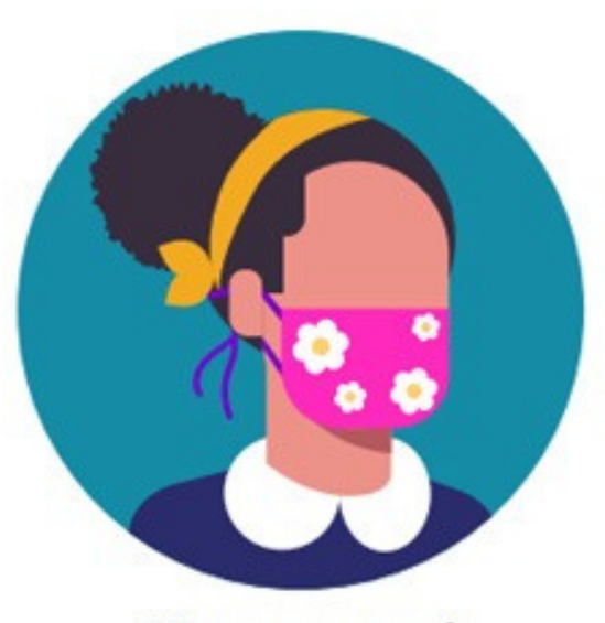
Wear a mask