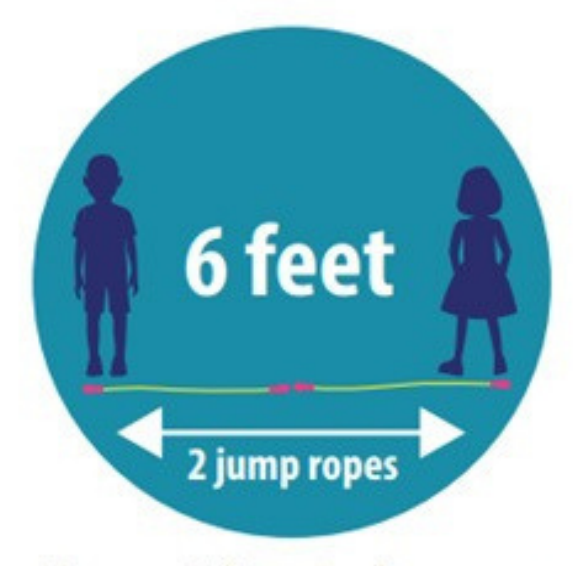
Keep 6 feet of space between you and your friends